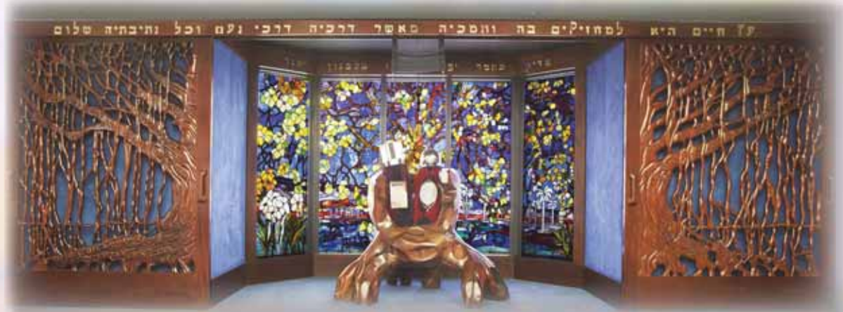
Bima at the Jacob Rechtschaffer Synagogue, at Miami's Jewish Home for the Aged, in their Siepen Towers.