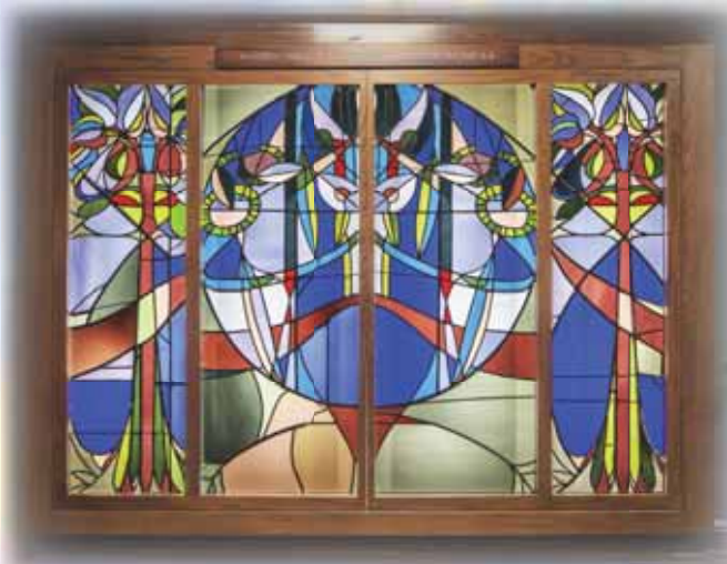
One God. University of Florida's Judaica Suite at the Smathers Libraries.