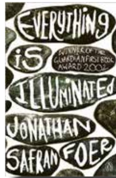
March 7 Everything is Illuminated by Jonathan Safran Foer