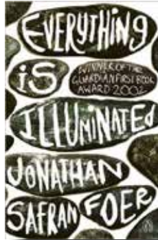
March 7 Everything is Illuminated by Jonathan Safran Foer