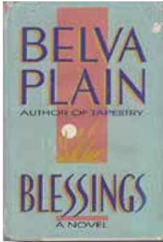
February 7 Blessings by Belva Plain

Members and friends, You are invited to join the Beth Shalom Book Club. Meetings are held on the first Tuesday of each month, 11:00 a.m. to 12:00 p.m.